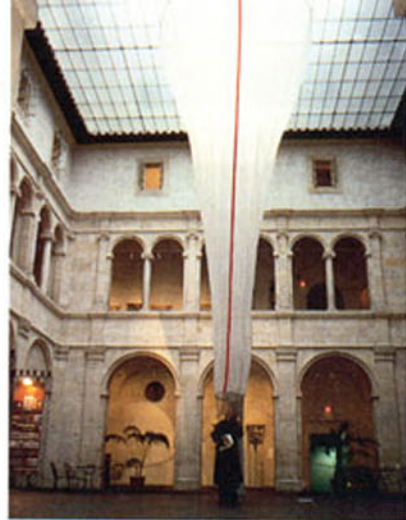
Above: Inside Out / Steel Lining , 1998. Knitted stainless steel, nylon, steel, and sign, 36 x 13 ft. diameter. Installation at the Fogg Art Museum, Harvard University. Below: Trying to hide with your tail in the air... , 1998. Hand-knotted and machined nylon nets, electrical and lighting materials, and steel, 18 x 9 ft. diameter. View of work installed at the Museum of the Center of Europe, Vilnius, Lithuania.

Target swooping down...bullseye! , a 20,000-square-foot lacy net funnel form made with 1.56 million handmade nylon knots, was created to span the monumental circular entrance courtyard at the 2001 ARCO art fair in Madrid. The floating structure transformed visual experience into a sensation of being embraced. The work's organic form invoked the closeness