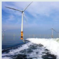
An offshore wind farm

A massive stretch of water 14 miles south of Martha's Vineyard will be home to the nation's largest offshore area for wind energy commercial