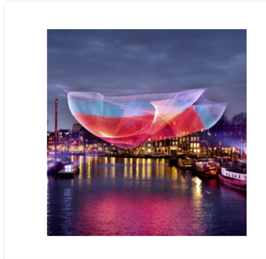
1.26 Amsterdam, suspended over the Amstel River