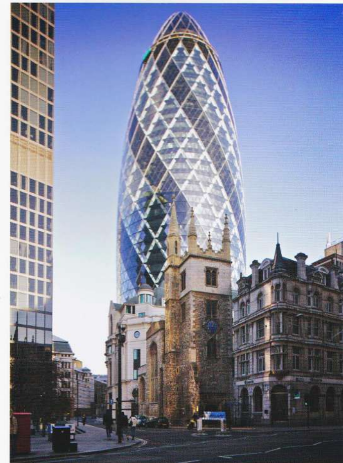
Fig. 15. Foster + Partners, Swiss Re Headquarters in London, 1997–2004.

Does Carpenter's Vessel qualify as a basket? Or Hackenwerth's and Echelman's airborne sculptures? The Swiss Re building? What about Big Bambú: You Can't, You Don't and You Won't Stop , the installation by Doug and Mike Starn on the rooftop of Metropolitan Museum in 2010 that was part sculpture, part architecture, and ongoing performance (figures 17 and 18)? 17 What about the bamboo scaffolding found throughout Asia and a mainstay of construction projects to this day? Is it necessary that these makers, designers, architects, and their works fit into some category, or can they compel us to think more broadly about the field? Basket artists and artists inspired by baskets are re-interpreting construction as well as the interstitial play of light and air that appears between woven elements. Investigating line and space, they explore the tension between interior and exterior, space and time, strength and fragility, self and other. In so doing, they unlock the potential of the basket to bind, free and interrogate the space between.