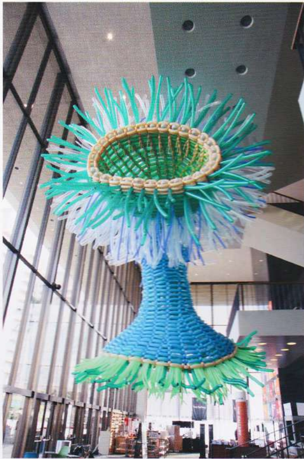
Fig. 12. Jason Hackenwerth (b. 1970), Nucleotide , 2011. Latex balloons: 28' × 23' × 26'. Long Beach Convention Center, Long Beach California.

Larger is the work of Janet Echelman, whose monumental, aerial forms got their start in the late 1990s with fishing nets when she was a Fulbright scholar in Mahaballipuram, India. Nowadays, her sculptures rise several stories in height and can be experienced in locations around the globe (figure 13). Brightly lit and held aloft by cables, her soft, undulating forms sway in the wind and look as much like sea anemones as large openwork bowls. Echelman achieves a subtle balance between structure and space, allowing the forces of nature—whether wind, water, or light—to allow movement within the whole. 14 Echelman employs computer-generated designs and a cadre of fabricators, thereby removing her hand from the process, but with more than a million knots in each project this is truly the work of many hands. In her desire for even greater public participation, the artist has offered viewers control over light projections with mobile devices, and engaged dancers whose movements are digitally connected to the nets. By prioritizing social interaction and community engagement, Echelman holds passersby in a joyful embrace.