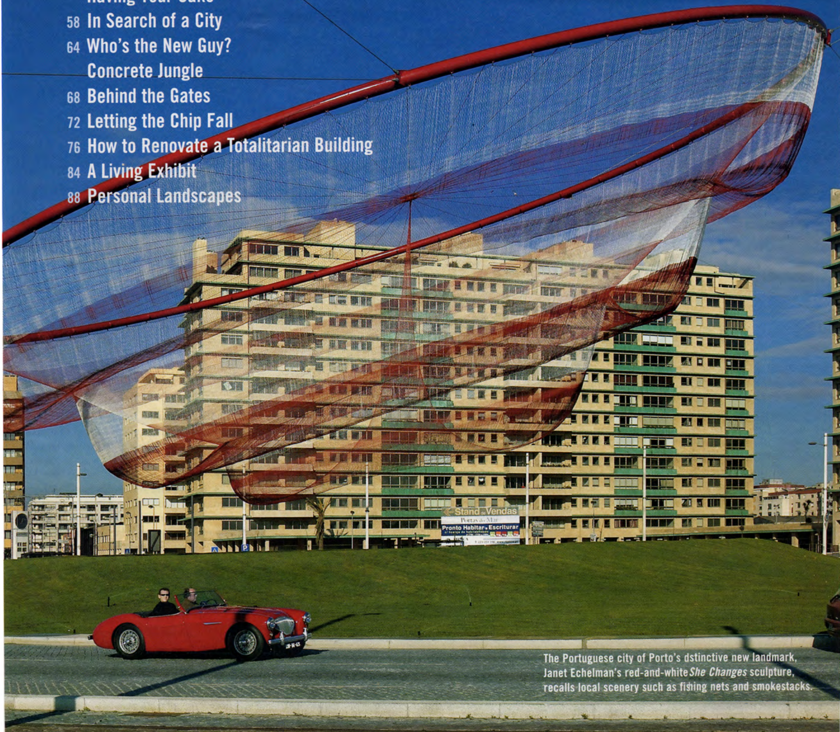
The Portuguese city of Porto's distinctive new landmark, Janet Echelman's red-and-white She Changes sculpture, recalls local scenery such as fishing nets and smokestacks.